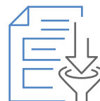
Filter Dangerous Content